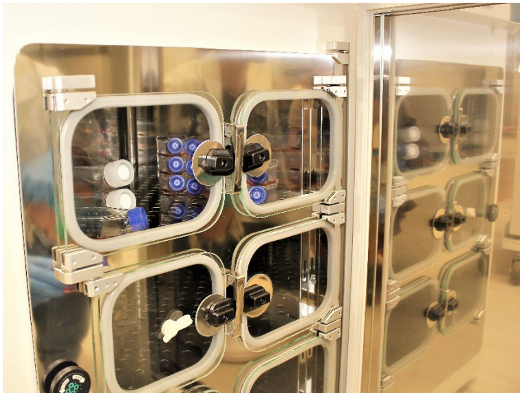
CO 2 incubator