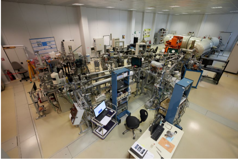
Photo: Nuclear Physics Institute of the CAS in Řež - Tandatron laboratory