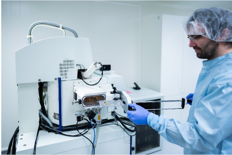
Photo: Institute of Photonics and Electronics - Clean rooms for the fabrication of nanostructures using lithographic techniques